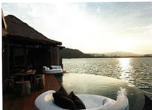
ABOVE Guests can relax by their exclusive two-bedroom villa at Song Saa Hotels and Resorts.