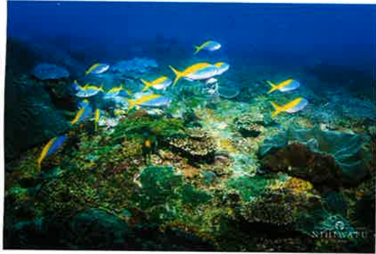
ABOVE Nibiwatu, a resort available for exclusive use on remote Sumba Island in Indonesia, has amazing marine life.