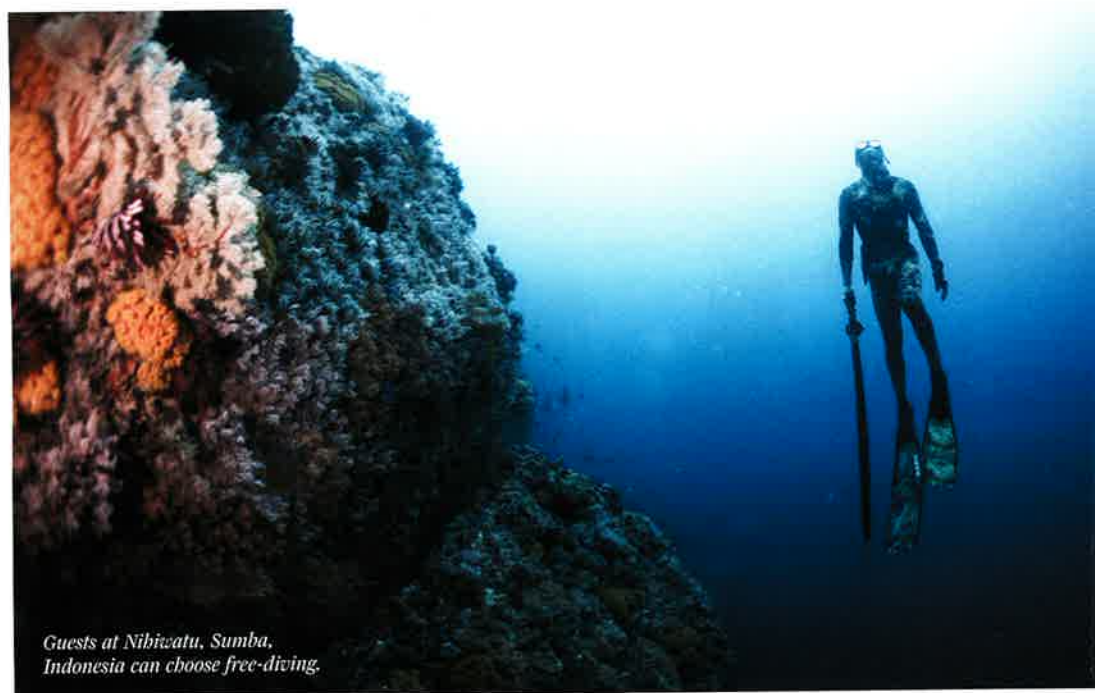
Guests at Nibizatu, Sumba, Indonesia can choose free-diving.

It's no surprise then that eco-tourism makes for