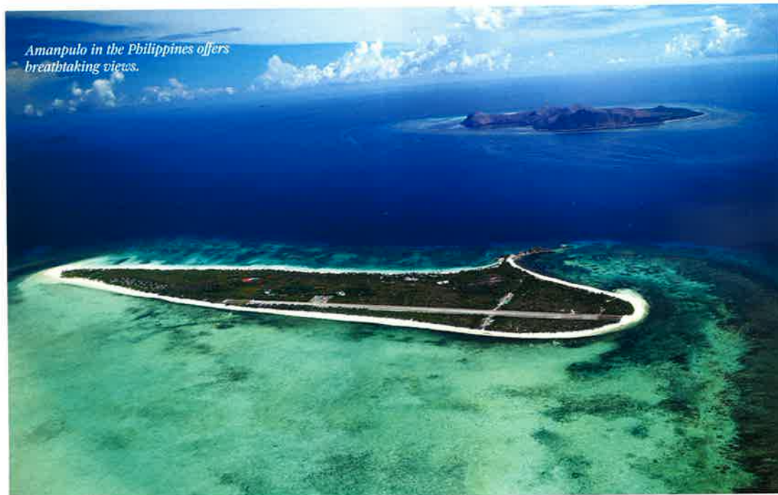
Amanpulo in the Philippines offers breathtaking views.